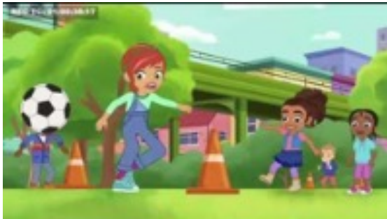
Fred Rogers: Alma's Way S.1

Check out the following video clips that are samples of the programming produced during this quarter under the Television Access H327C210001 project.