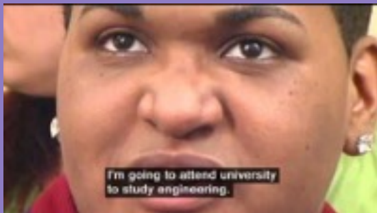
Profile of the Beneficiaries

Aligned with Dicapta's mission, the H327C210001 project funded by The US Department of Education, Office of Special Education-OSEP allows us to serve children with sensory disabilities-especially those who are deafblind and those of Hispanic origin.