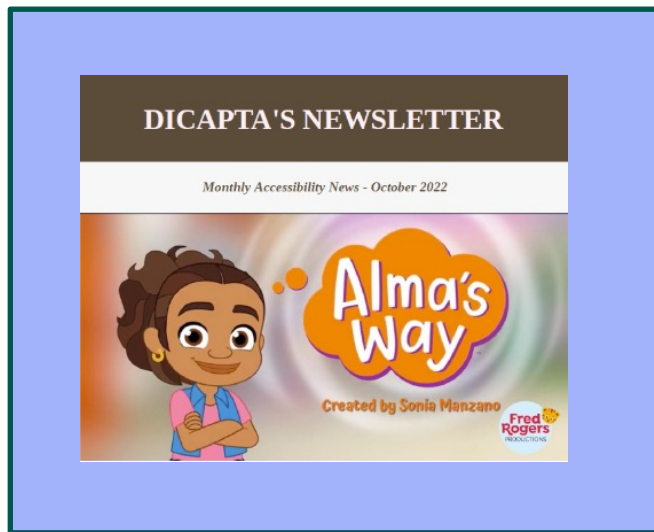
Dicapta October's Newsletter