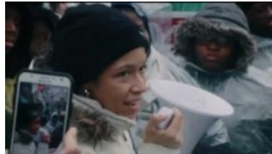
POV: Let the Little Light Shine