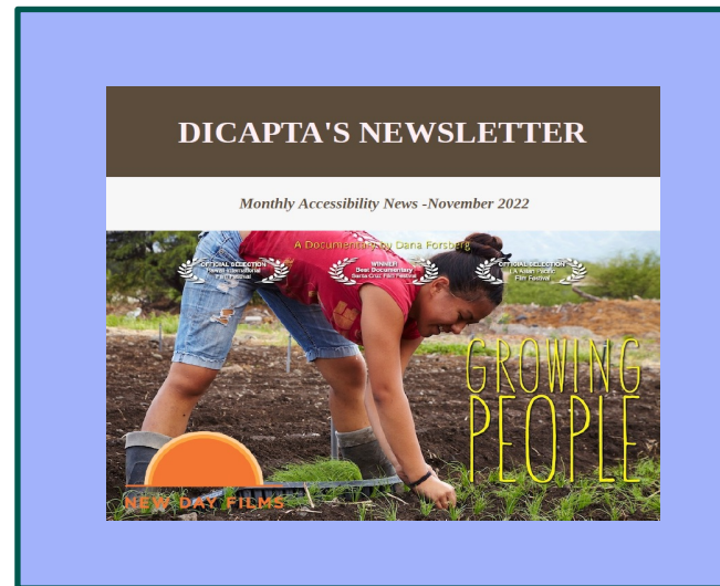
Dicapta November's Newsletter